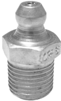
High pressure grease nipple HFN 820.01.700

max. working pressure: 700 bar wrench size: SW 11 Thread: NPT 1/8"